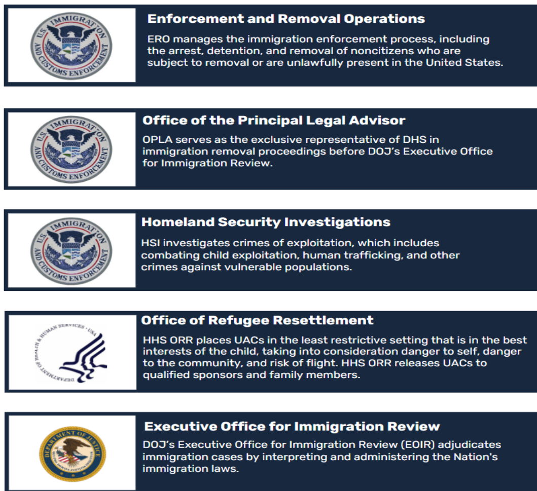
Figure 2. Federal Agencies 13 and ICE Offices Involved with Unaccompanied Alien Children Released or Transferred from DHS and HHS' Custody